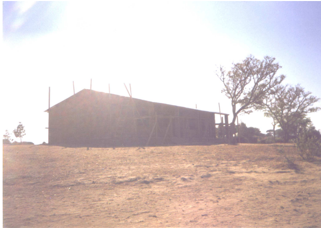
School building in Malawi, 1997

We have funded student scholarships for around 1.200 primary students, 550 secondary students plus 3 students at Technical Colleges.