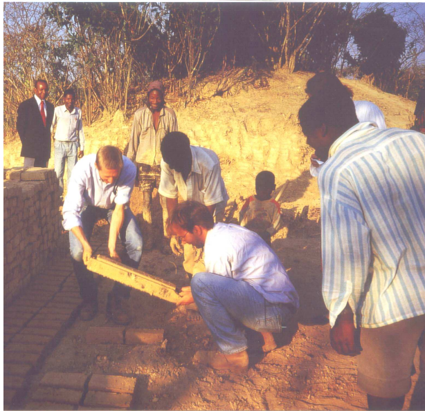
Building schools with „Chancen durch Bildung“

Donations account: Chancen durch Bildung e.V. Spenden-Konto-Nr. 2124 6970 Stadtsparkasse München BLZ 701 500 00