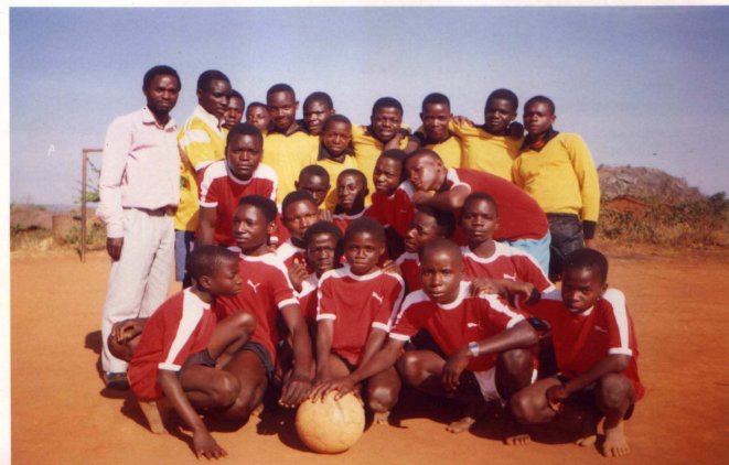
St. Michael's School Football Team Mzuzu (North Malawi) sponsored by "Chancen durch Bildung"

15 years ago it was one student's idea to help needy students in Malawi. This was a one-off venture but now we are accredited as a non-profit